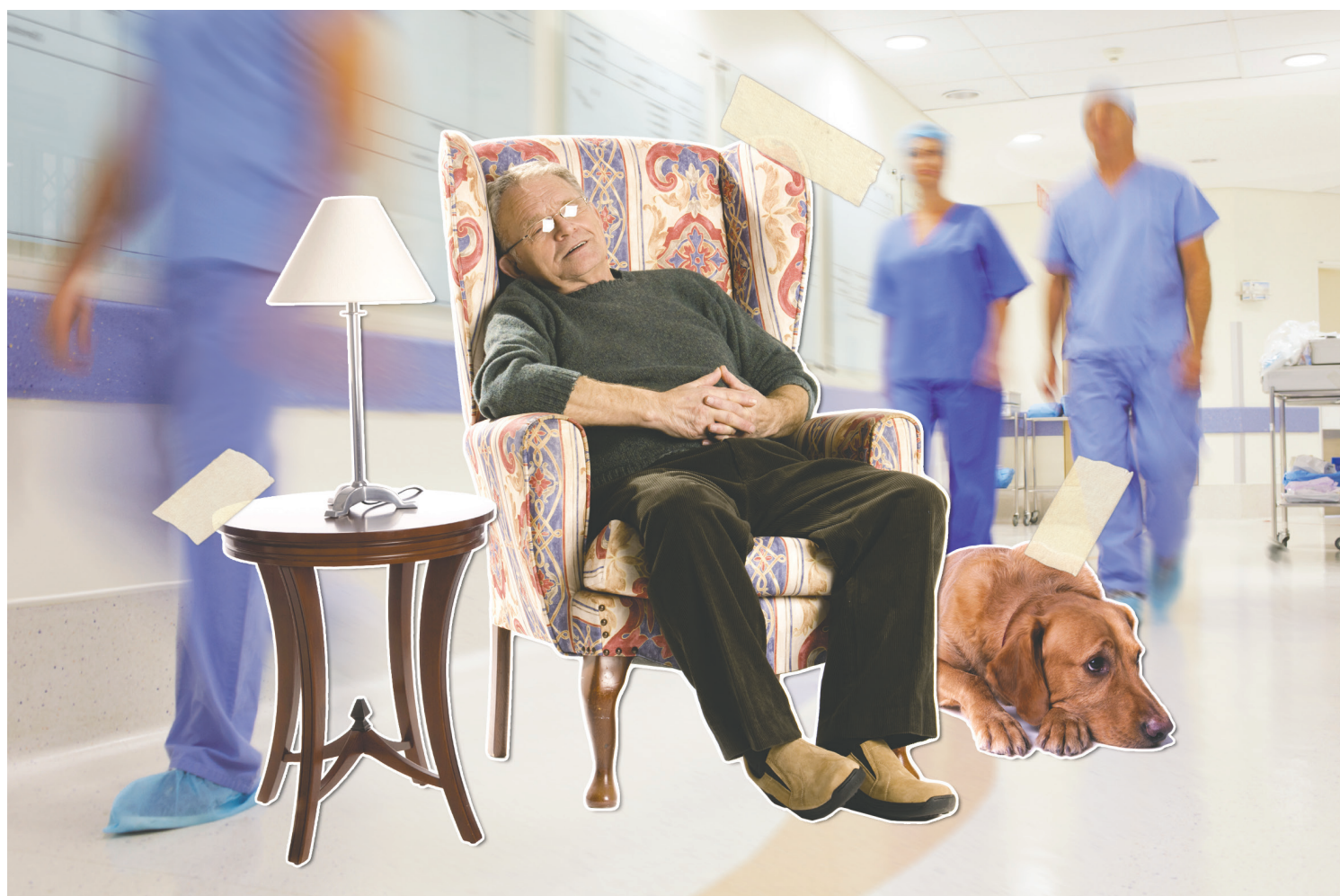
Nearly all Canadians say it is important that we have the ability to age at home with access to health care in a home setting. Photo illustration by Megan Goodacre